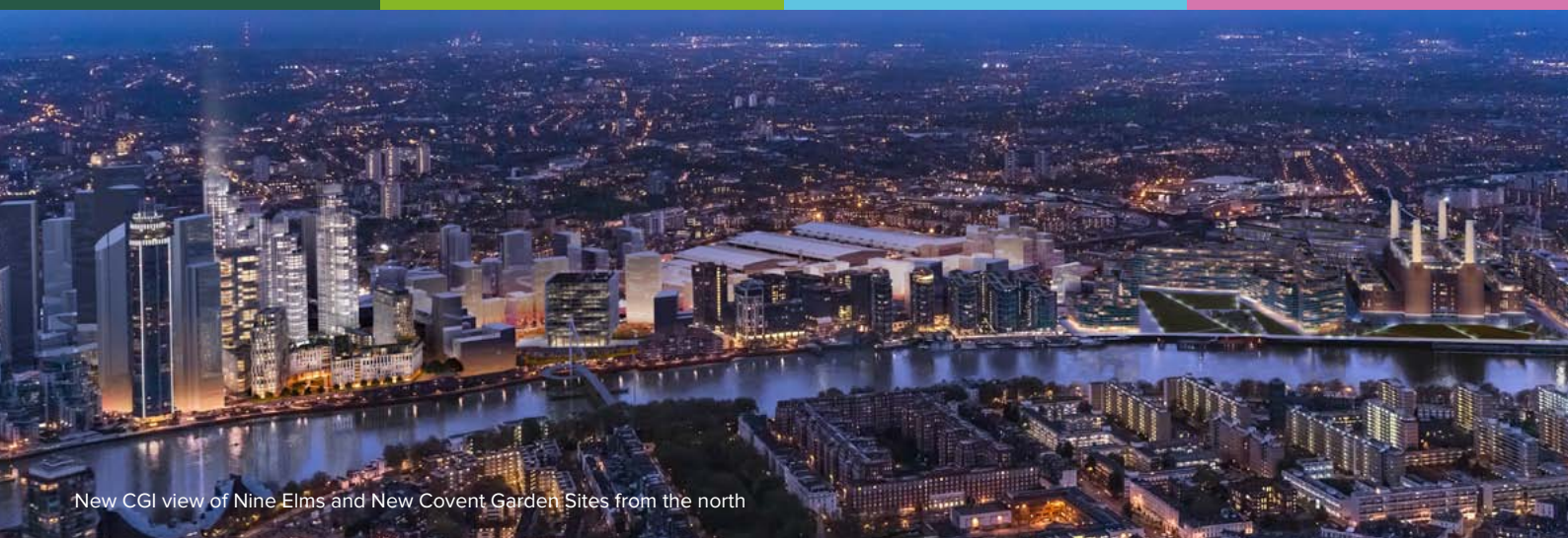
New CGI view of Nine Elms and New Covent Garden Sites from the north