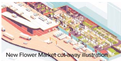
New Flower Market cut-away illustration