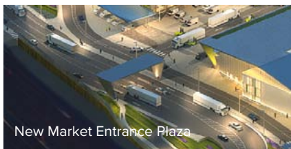
New Market Entrance Plaza